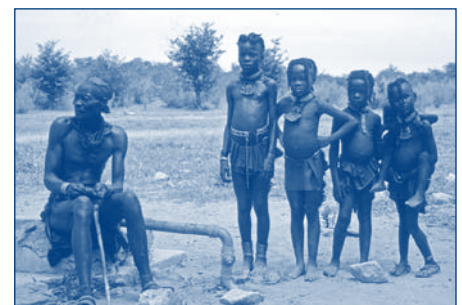
Himbas in north-western Namibia

the many other study abroad opportunities at the UA, are encouraged to visit http://studyabroad.arizona.edu . Students can also visit the Office of Study Abroad and Student Exchange at 939 N. Tyndall Avenue or call (520) 626-9211.